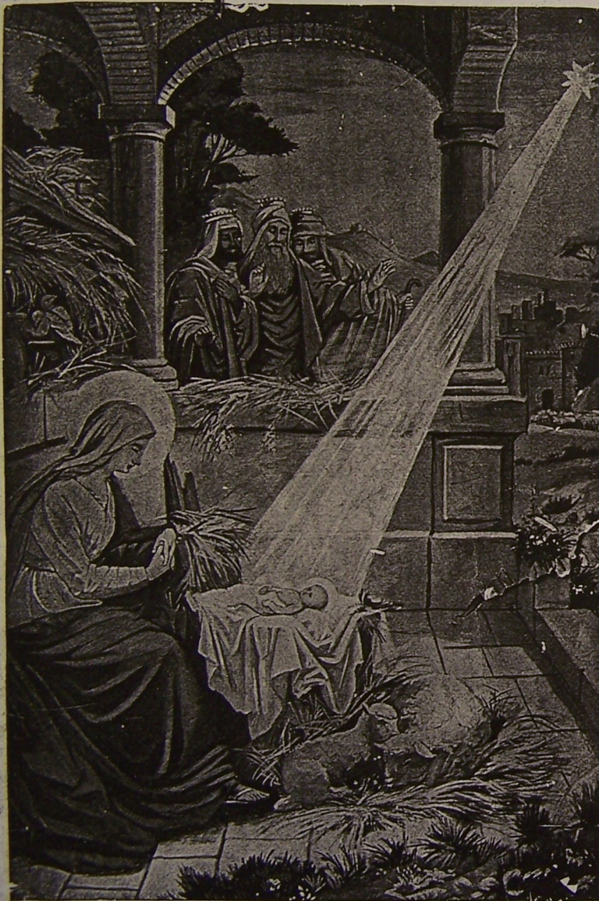
VISIT OF THE WISE MEN

SHOWING IN SIMPLE FORM ALL CHANGES, ADDITIONS AND OMISSIONS MADE BY THE REVISERS IN THE KING JAMES VERSION